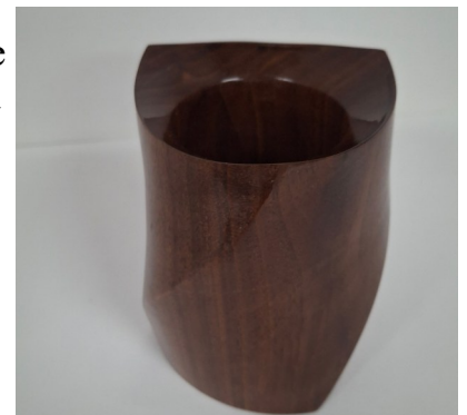
The Finished Pencil Holder.