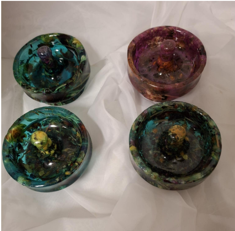
Dallas Hensley—Ring holders made of flowers and epoxy resin.