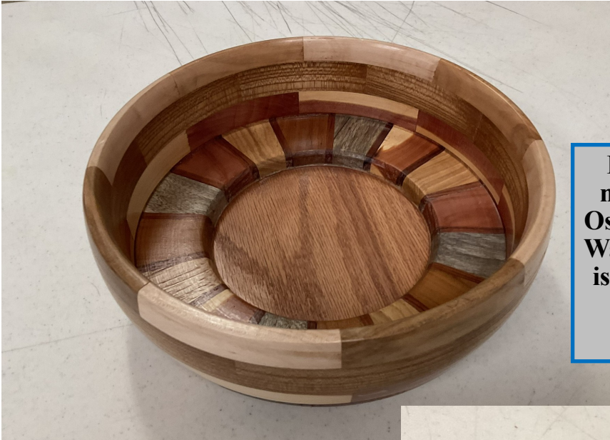
Ron Hulstein—Ron's 49th segmented bowl. It is made of: Ash, Osage Orange, Spalted Hackberry, Walnut, Sapel and Red Cedar. Finish: 2 coats sealer, 3 coats lacquer and 2 coats wax.