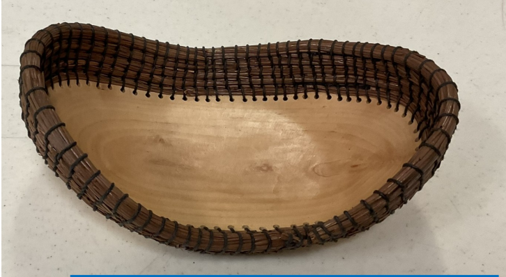
Bowl woven with leather.